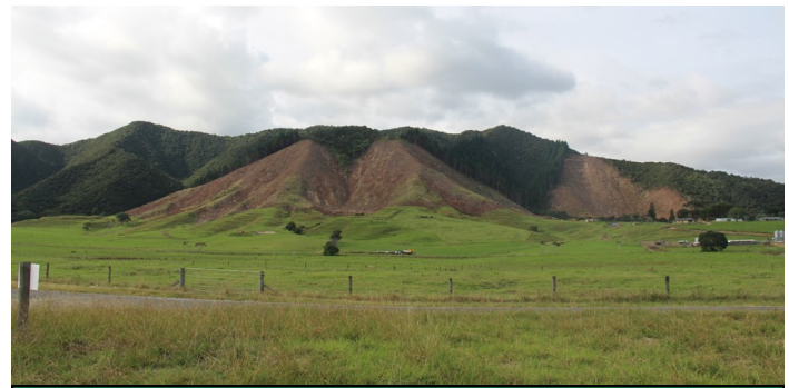
Post harvest with minimal disturbance to archaeological features thanks to the careful earthworks and harvesting

Due to the concentration of historic sites, a detailed archaeological investigation was required, to determine the exact location of the archaeological features. This involved removing topsoil from areas where earthworks were proposed to identify any below surface evidence. The initial investigation uncovered further evidence of kainga, drainage trenches and gardens, even in areas with no surface features. Based on this information the harvest plan was developed to minimise