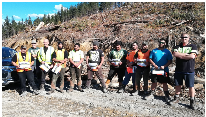
The team involved with Tunapahore B2A—Maungawaru Crew 902, Wilson Earthmoving receiving their Environmental Award from HFM NZ

HFM NZ recognised the Maungawaru crew and earthworks operator from Wilson Bros Earthmoving with an Environmental Award for a job well done. All in all it was a great team effort by our Hancock staff, the landowners, archaeologists and contractors.