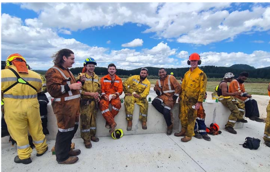
Ace of Spades crew having a well earned break after mopping up a fire in Kawerau earlier in the year

HFM NZ wishes Ace of Spades every success and looks forward to working with them into the future.