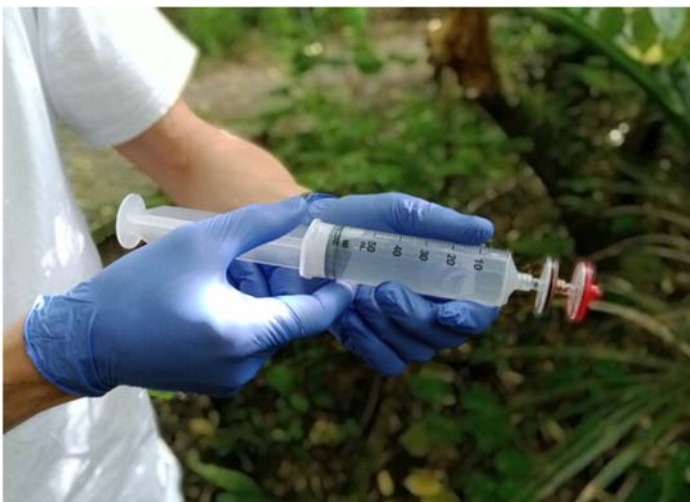
Collecting a water sample for eDNA analysis

Water monitoring is an area that is rapidly developing and HFM NZ is keeping a close eye on further developments in this space.