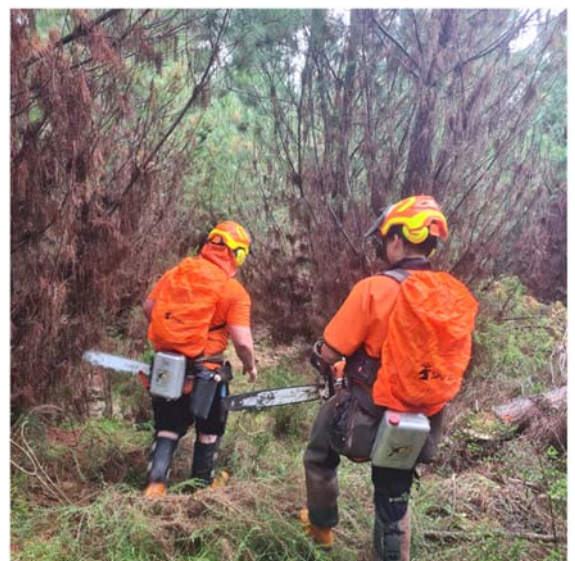
Ace of Spades crew off to undertake thinning